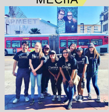
Mechistas attended the 26th annual MEChA conference in LA. They attended workshops on the UCLA campus, participated in a social justice solidarity 3-mile march, and listened to panels.