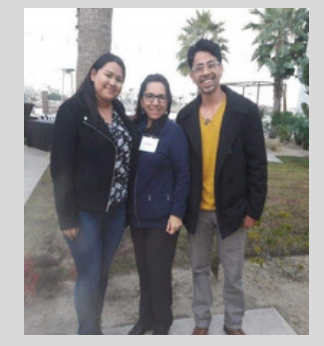
Dreamers United members and advisor attended the Catalyst Conference in Long Beach, Ca this spring.